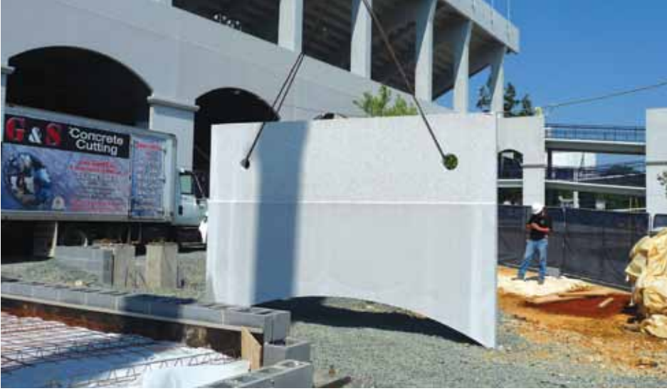
The 8-inch-thick concrete sections were lowered by crane.