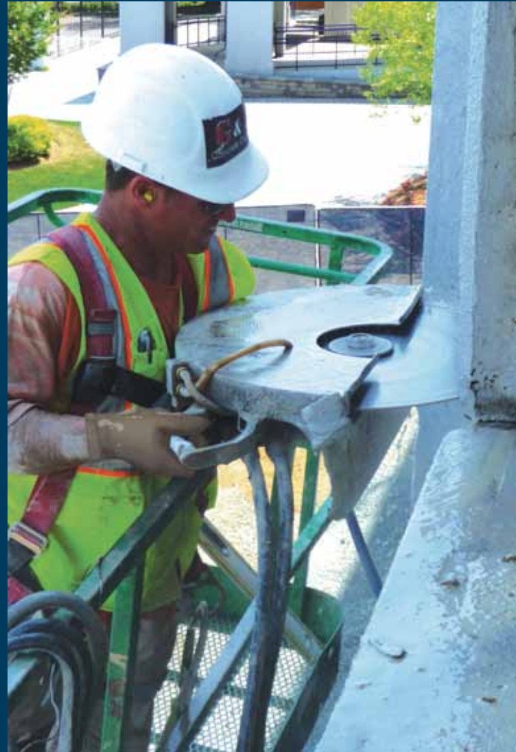
A hand saw was used to cut the 14-foot-wide and 4-foot-tall sections.