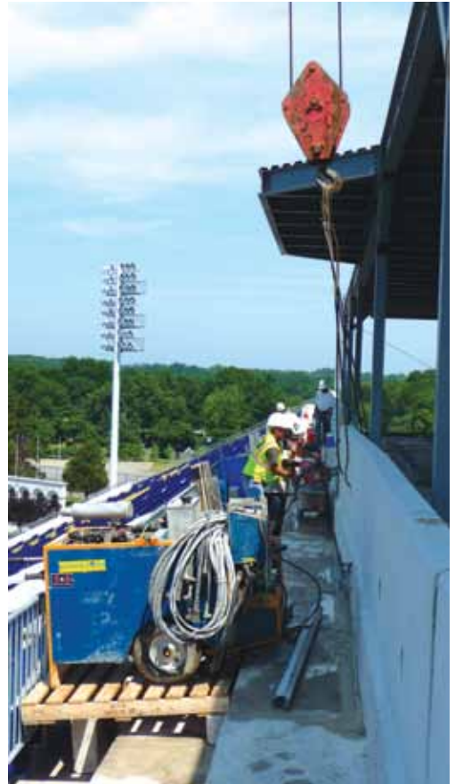
New sky boxes were installed at the top of the stadium after cutting.

1250 NW Main Street • Lee's Summit, MO 64086