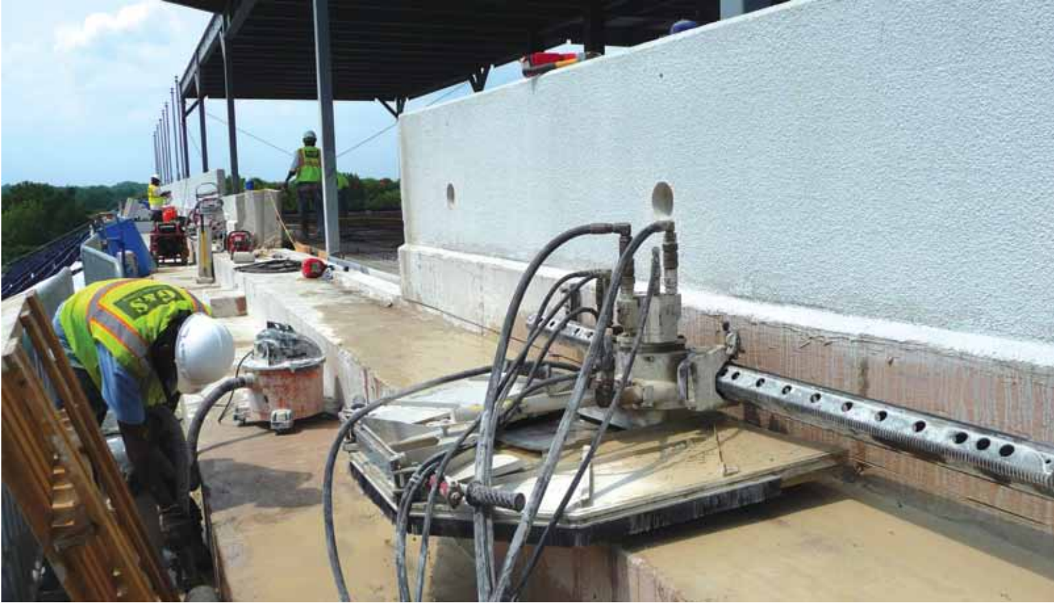
Cut wall sections were lifted out by crane or placed on pallets for removal.

supply, so a water hose had to be run up to the top of the stadium to allow wet cutting. The foundation and sections of the steel structure had already been set in place to construct the new sky box, so the positioning of the contractor's truck and hydraulic equipment was limited. The general contractor was able to remove a section of fencing around the stadium to move the truck and equipment closer to the work area.