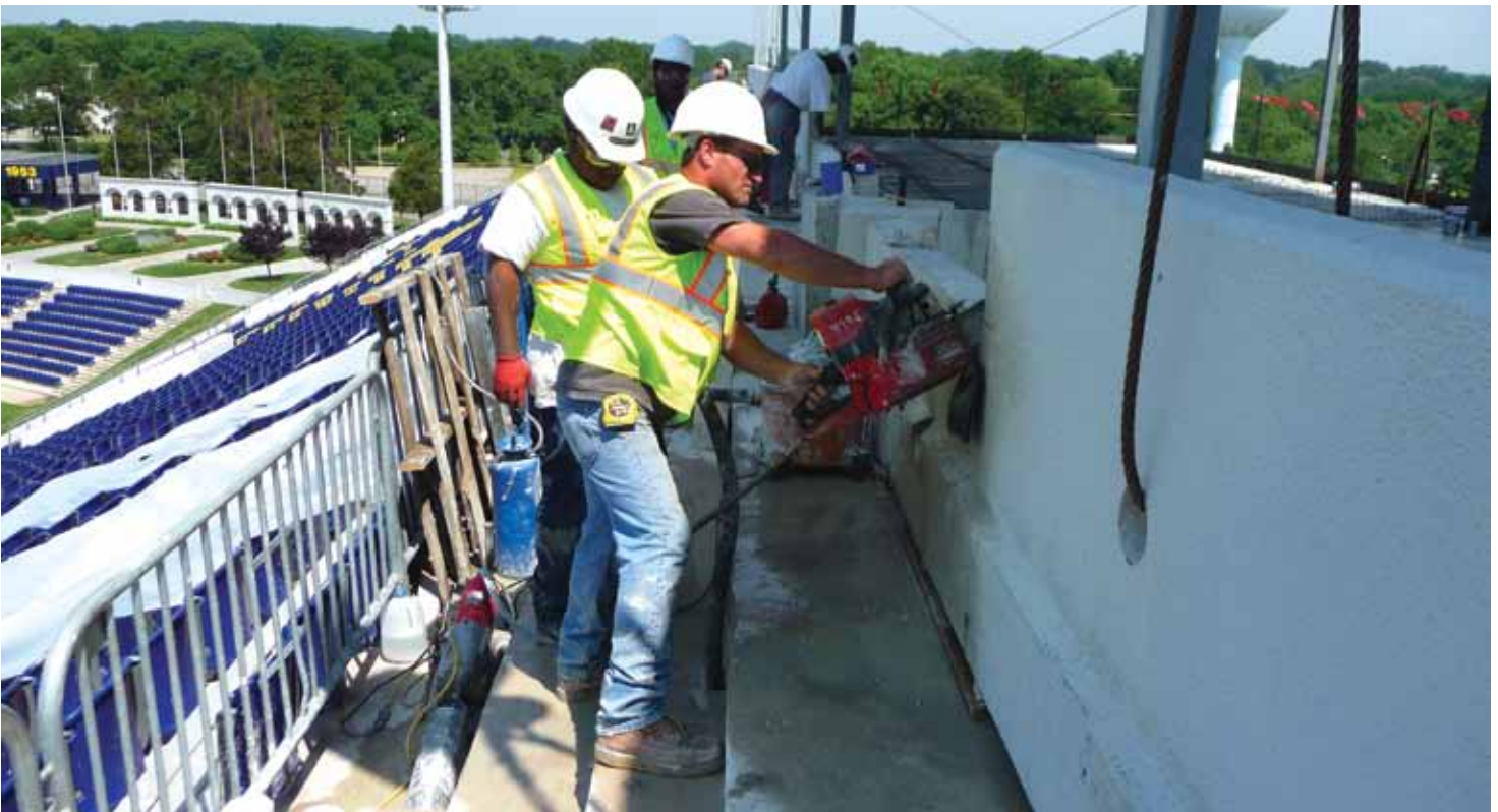
Corner cuts were made using a diamond chain saw.

Within three weeks, the contractor was asked to return to the stadium to cut and remove 136 linear feet of concrete from the top wall. The cutting work was split into eleven 12-foot-long sections that ranged from 8 to 12 inches thick. Some sections were to be cut by wall saw and removed by crane, while other sections had to be cut free using a hand saw and placed onto pallets for removal. This